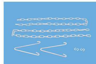
HF-2CV (2 foot) HF-3CV (3 foot) Hanging Chain & V-clips