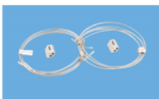
HFA-WCH Wire Cable Hanging Kit (2 pcs per kit)