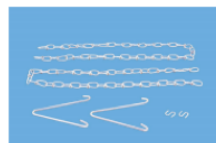
HF-2CV (2 foot) HF-3CV (3 foot) Hanging Chains & V-clips